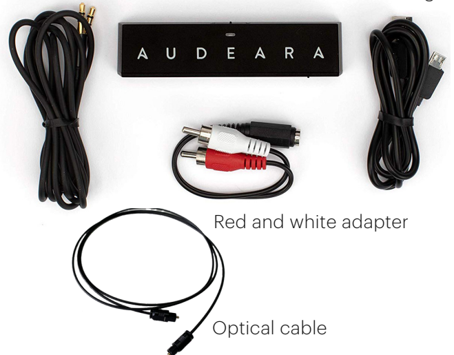
Red and white adapter